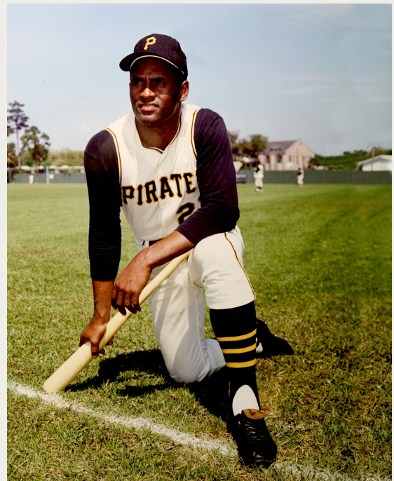
Image of Roberto Clemente from the Society for American Baseball Research