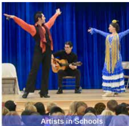
Artists in Schools