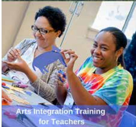
Arts Integration Training for Teachers

Building a better Wake County through the arts