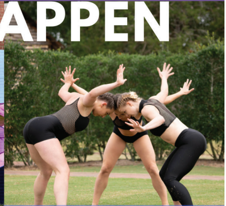
Grants for Artists & Organizations