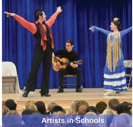
Artists in Schools