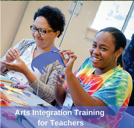
Arts Integration Training for Teachers

Building a better Wake County through the arts