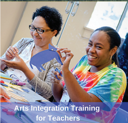
Arts Integration Training for Teachers

Building a better Wake County through the arts